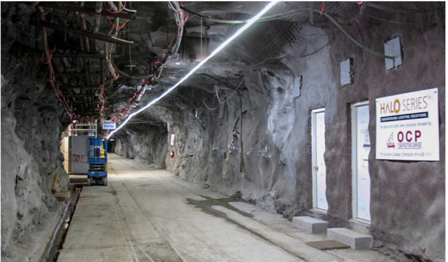
NORCAT Underground Centre

ontheground The International Division of MineAfrica Inc. group